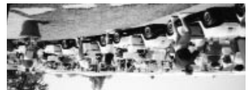
Report on PAA's 4th Annual Scholarship Golf Tournament. See page 4.

For detailed course descriptions, visit our website: www.pharmacy.wisc.edu/esp/ . For registration materials or other information, contact: Extension Services in Pharmacy, 777 Highland Ave., Madison, WI 53705-2222. Tel: 608/262-3130 Fax: 608/262-2431