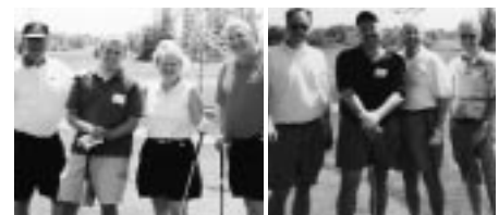
Other PAA supporters enjoying the Golf Outing.