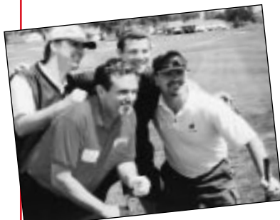
The Charter Street Boys.