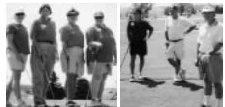
Women's and Men's Division winners.